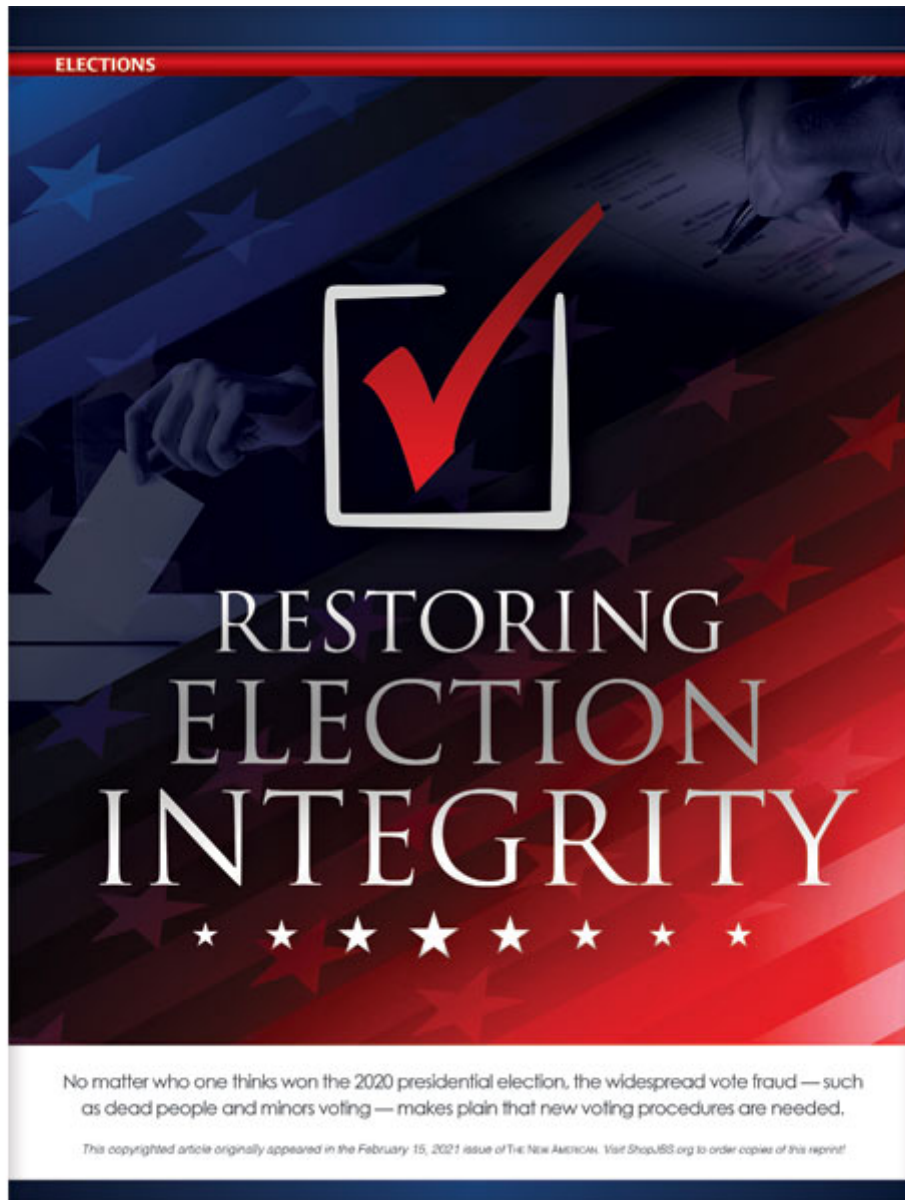
Restoring Election Integrity reprint