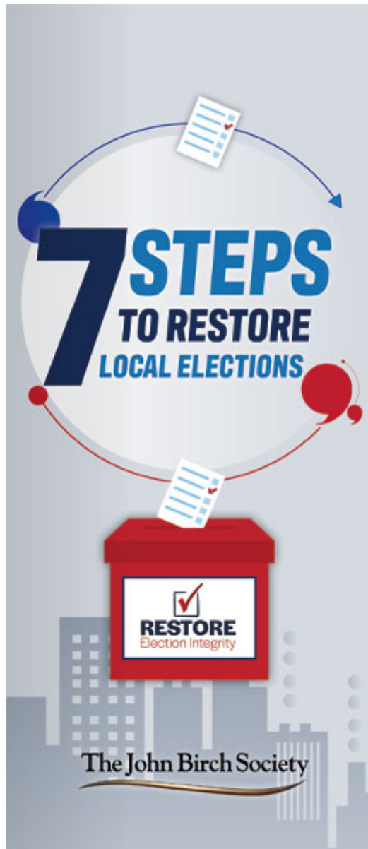
7 Steps to Restore Local Elections pamphlet