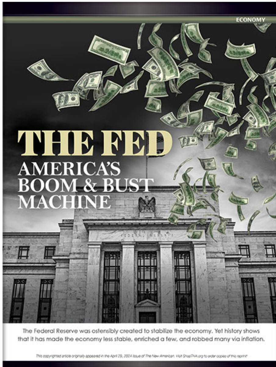
THE FED: America's Boom & Bust Machine reprint