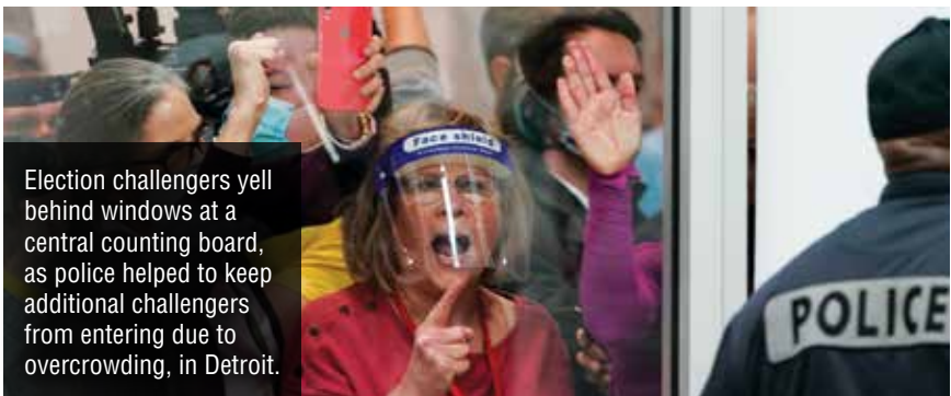
Election challengers yell behind windows at a central counting board, as police helped to keep additional challengers from entering due to overcrowding, in Detroit.