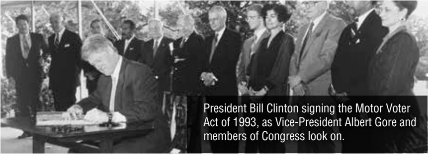
President Bill Clinton signing the Motor Voter Act of 1993, as Vice-President Albert Gore and members of Congress look on.

White House, Public domain, via Wikimedia Commons