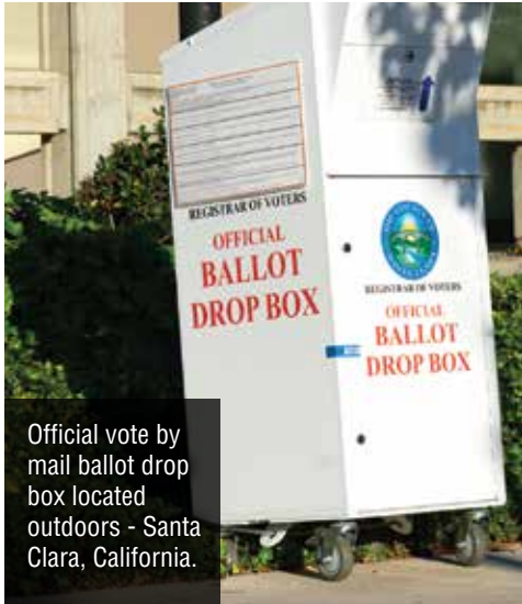
Official vote by mail ballot drop box located outdoors - Santa Clara, California.

Unattended drop boxes are vulnerable to having someone, ostensibly a voter casting a ballot, depositing an explosive device or an incendiary device in the drop box. Such an act could destroy untold numbers of ballots with no official record of how many ballots were destroyed or whose ballots they were.