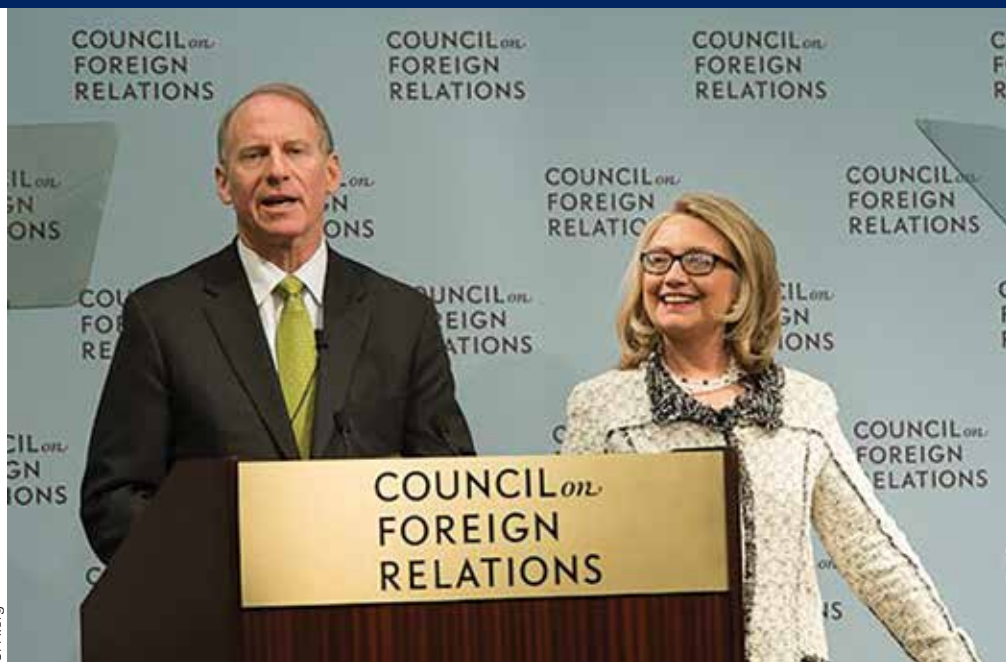
Tell us what to do and think: CFR President Richard Haass stands with Hillary Clinton (then secretary of state) in 2013 at one of her many appearances at the CFR, which, she said, is where she and other officials "go to be told what we should be doing and how we should think."

throughout our political, financial, industrial, educational, cultural, military, and intelligence institutions.