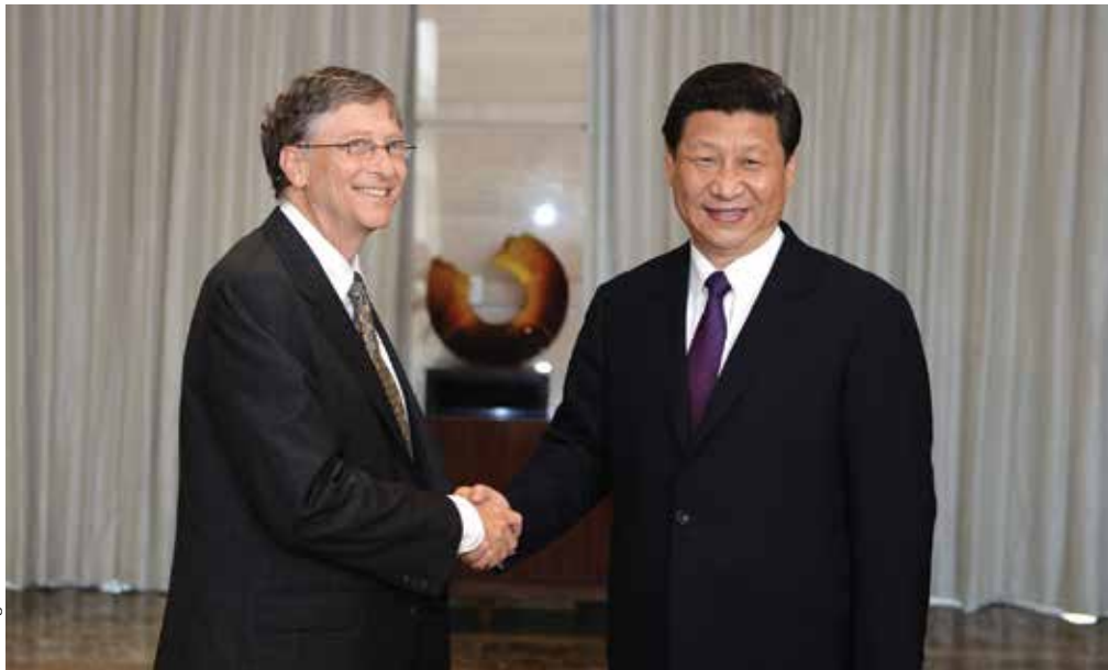
Comrades: Big Tech & Beijing — Microsoft billionaire Bill Gates meets with China's communist leader Xi Jinping (right) at the Boao Forum in China's Hainan province in 2013. In 2017, Gates was inducted into the elite Chinese Academy of Engineering.

The nationalist vs. globalist conflict is not merely an ideological struggle between shadowy, unidentifiable forces; it is a struggle with organized globalists who have very real, identifiable, powerful organizations and networks operating incessantly to undermine and subvert our constitutional Republic and our Christian-style civilization.