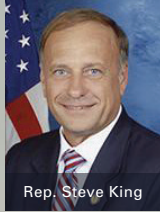
Rep. Steve King

Congressman Steve King served as a U.S. representative for Iowa from 2003 to 2021. He is the author of the book Walking Through the Fire: My Fight for the Heart and Soul of America .